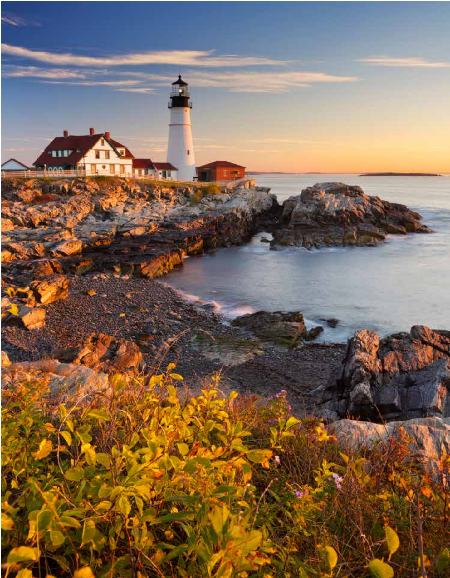
IMAGES OF THE PORTLAND, ME SURROUNDING AREA